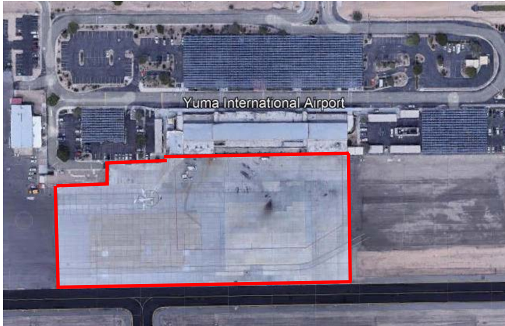
Commercial Air Service Terminal Apron

The successful completion of the project will result in a design prepared in accordance with AC 150/5320-6G “Airport Pavement Design and Evaluation”, specifications prepared in accordance with AC 150/5370-10 “Standards for Specifying Construction of Airports”, Complete Construction Documents, a Construction Cost Estimate and professional assistance in the public bid and bid evaluation and recommendation process.