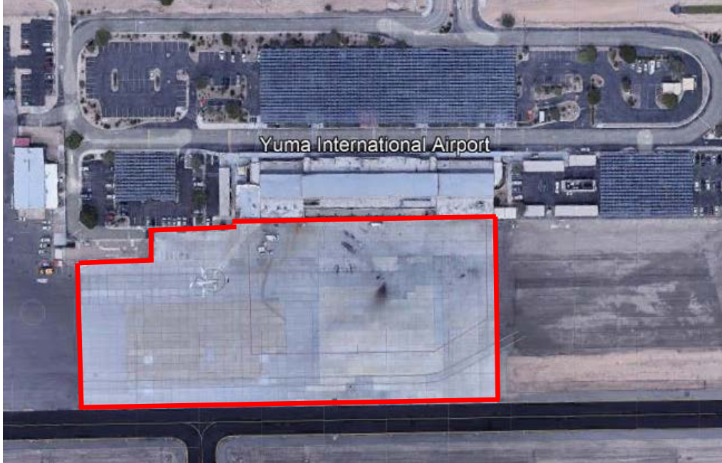
Commercial Air Service Terminal Apron