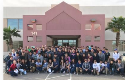
Mar 3 – U of A Eng 102 Classes