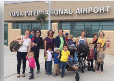
Feb 17 – Mom's Club