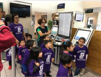
Feb 3 – Quechan Head Start

Yuma International Airport staff enjoys giving tours of the airport to students and groups of all ages. Our guided tours include discussions about Yuma's rich aviation history, introduction and discussions with the airline and TSA staff and walk-through of the airport terminal. We were thrilled to have the following groups in February and March! To schedule a tour please call 928-726-5882.