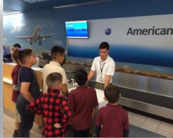
Feb 8 – Salvation Army