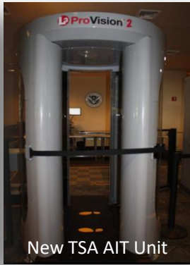
New TSA AIT Unit