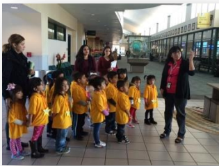
Feb 22 & March 1 - Chicanos Por La Causa