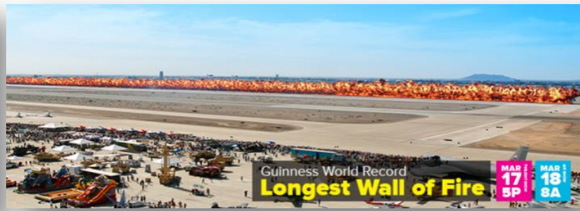
MCAS Airshow 3/18/17