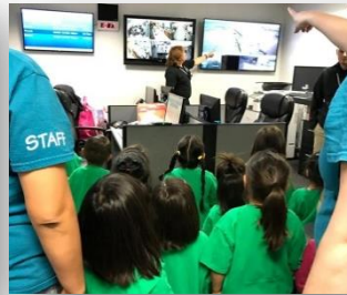
Feb 15 – Quechan Head Start