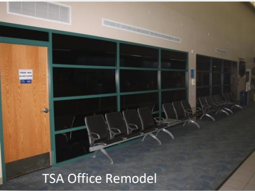
TSA Office Remodel

and let the adventure begin. YumaAirport.com