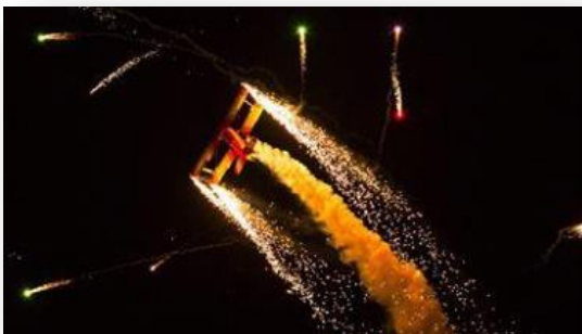
MCAS Yuma Twilight Show 3/17/17

Tickets and information about these events are available at www.yumaairshow.com