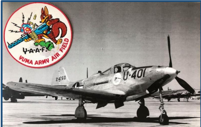
Pictured above is a Bell P-39 Air Cobra stationed at Yuma Army Air Field with the base insignia on the plane. The insignia has been recreated and adorns the 1943 L-2M Taylorcraft pictured below owned by a local pilot.